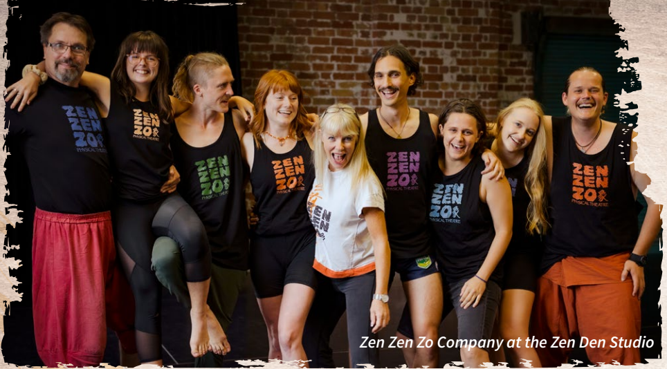
Zen Zen Zo Company at the Zen Den Studio